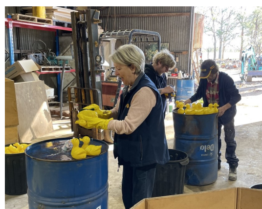
Our Rotary Duck Groomers, checking that every Duck is fully fit to race....