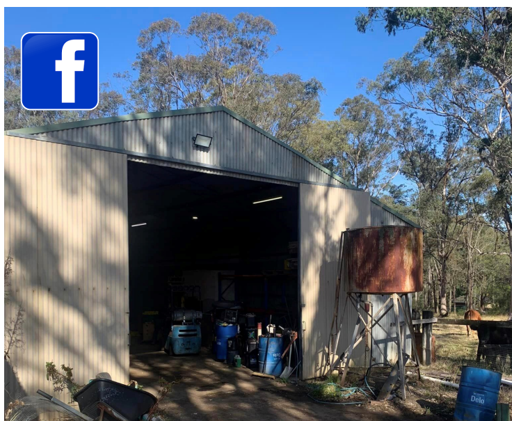
Private roosting shed where the ducks rest up for The Big Race