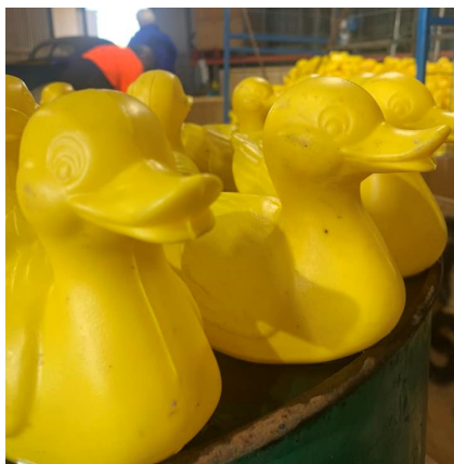
Some excited ducks, looking ready to go for the Big Race