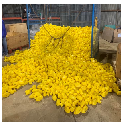
Lots of ducks falling over each other to be prepared for their race