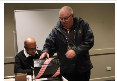
Some photos from last week's meeting