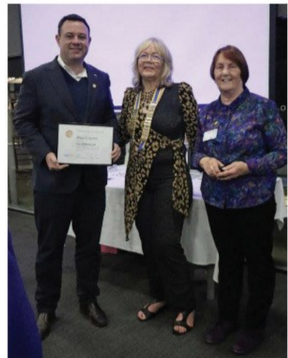
Changeover Night at The Lakeside Restaurant for Penrith Rotary. Photos supplied

together with Nepean Rotary to cook 8,000 sausages for the NAIDOC Day at Jamison Park, an amazing day.