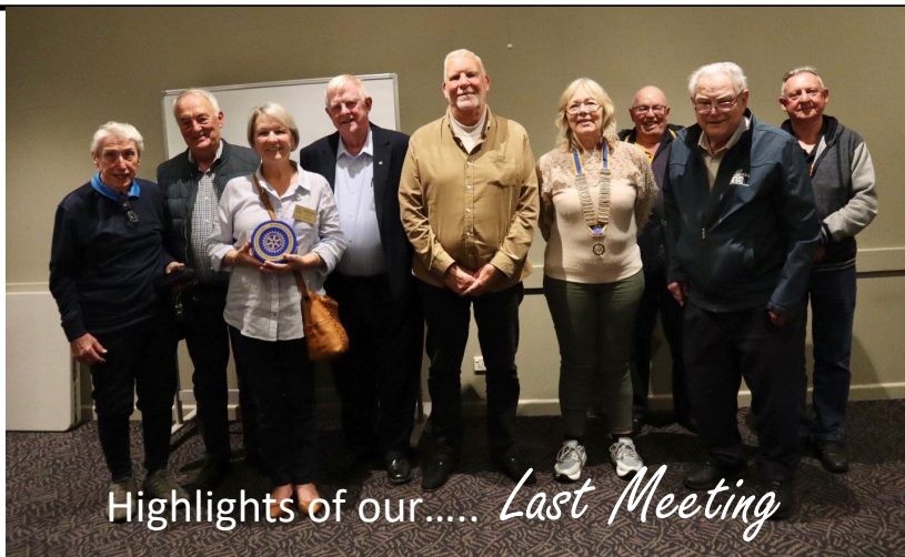
Highlights of our..... Last Meeting