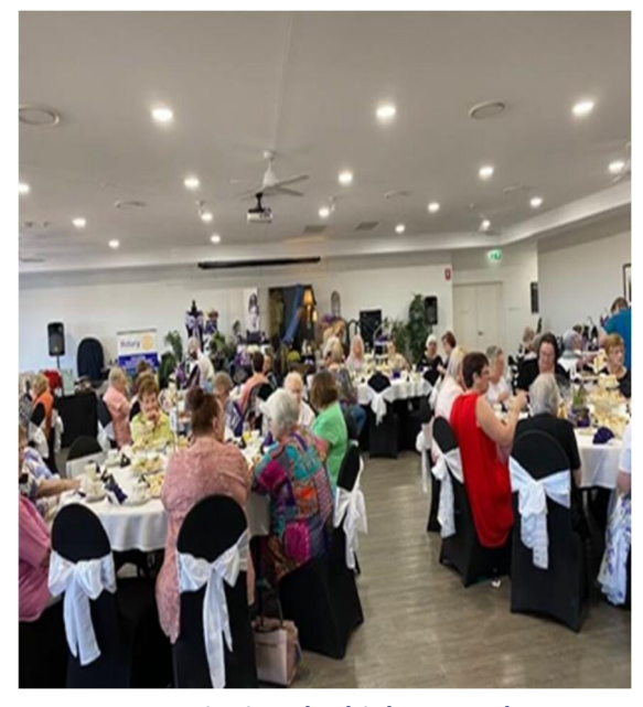
Our guests enjoying the high tea and were very generous with their support for Rotary Foundation.