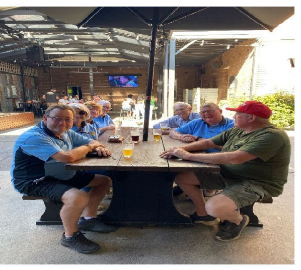
A well deserved refreshment at the end of the day.