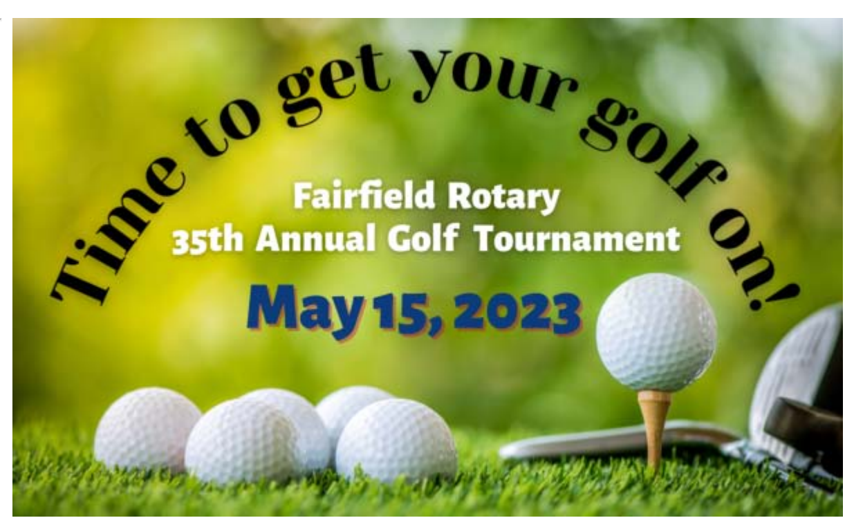
It's time to hit the links -

Join us on May 15<sup>th</sup> for our 35th Annual Golf Tournament at the Brooklawn Country Club.