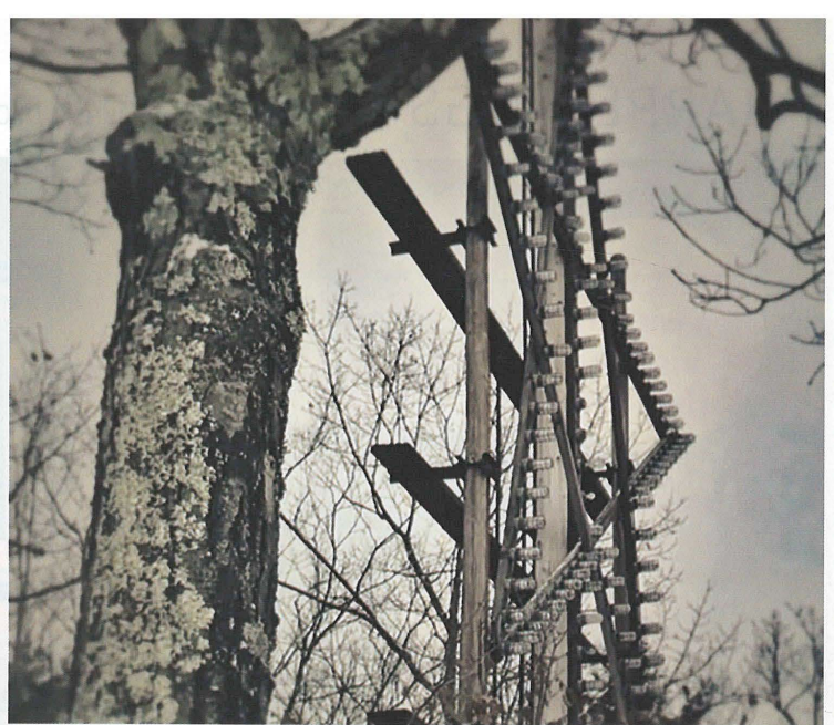
After welcoming people home since 1957, the wooden star will be updated to a modern steel version.

the old star and install the new one, tentatively scheduled for May 2024. A large plaque will recognize donors who contribute $500 or more. Fundraising kicked off with a sold-out gala earlier this month at the Woodstock Inn & Resort.