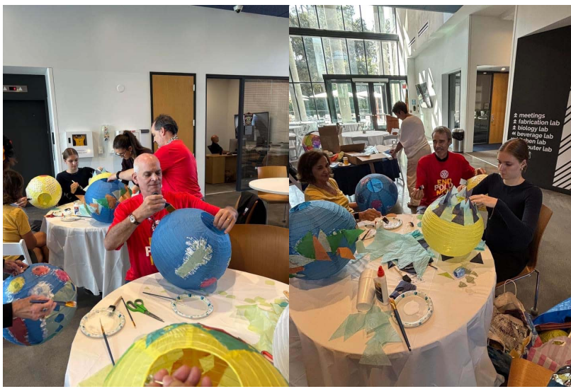
Images courtesy of Club photographer, Larry Sanders Text inspired from the Hilton Head Island Rotary Club Facebook page

The following are the link and passcode if you missed the meeting or would like to see it again: