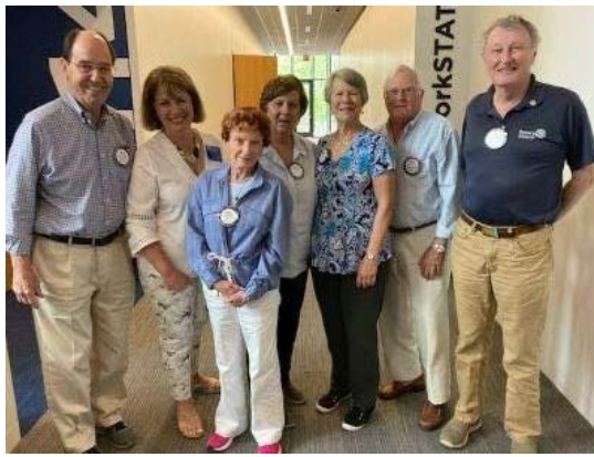
2023 Scholarship Committee

If you missed the meeting, here's the link.