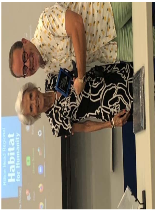
Four Way Test Award