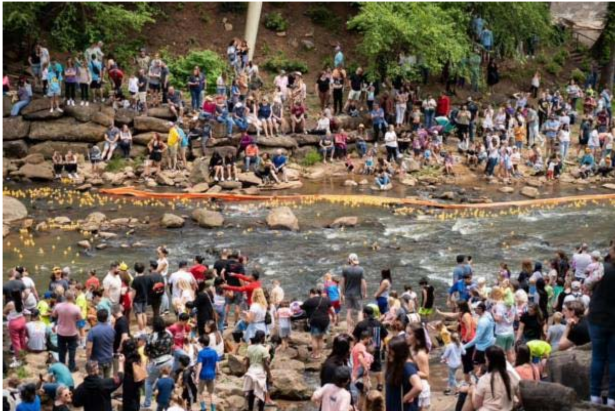
Duck Derby 2023 . . .