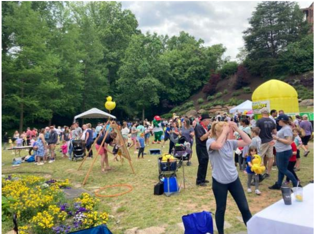
A couple of Duck Derby pictures . . .