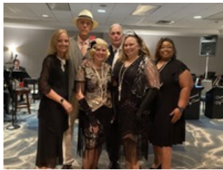
Yours in Rotary Service, DG Allen District Governor 2023-24