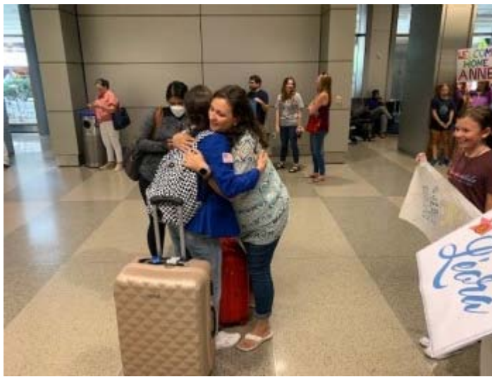
Meeting her host mother