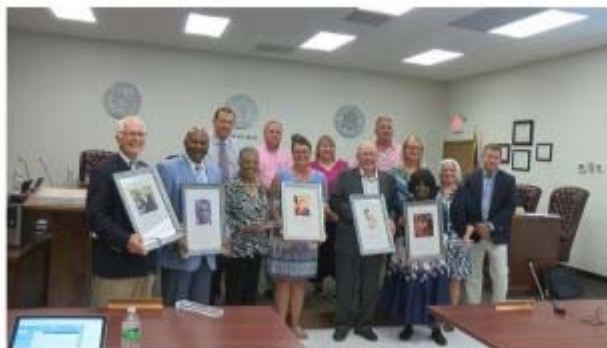
First class of PCS Wall of Fame honorees inducted on Tuesday night