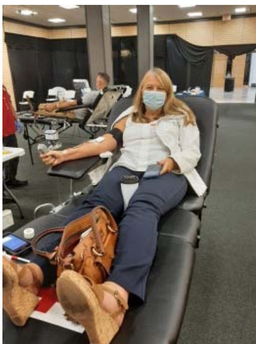
The Red Cross held the 'Battle of the Breweries Blood Drive' on 3/30/2022 at the Hotel Ballast in