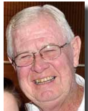
Smallwood: lives of birds