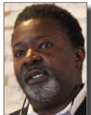
Roberts: aid to ex-inmates