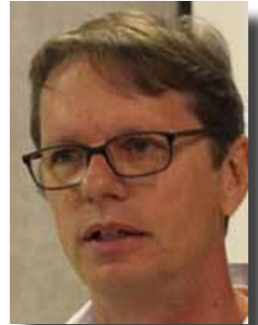
Keith: machine intelligence