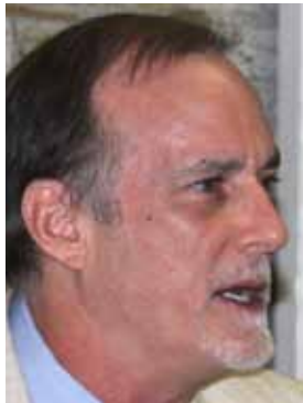
Fonvielle: Civil War flag