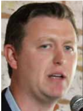
Pyron: State Ports