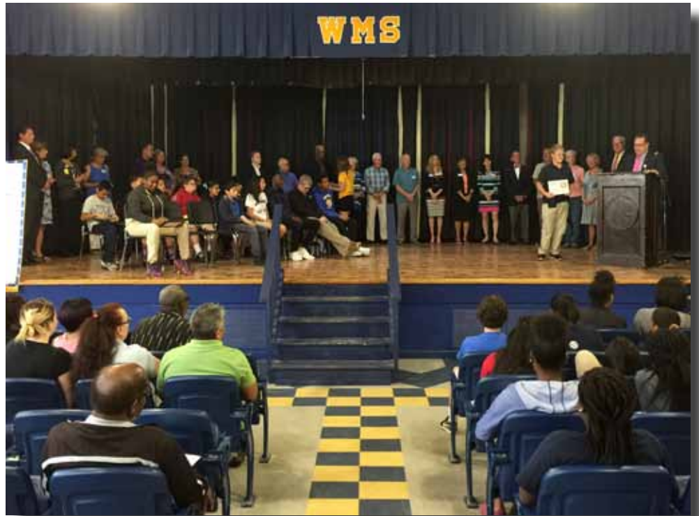
Honored students and visiting Rotarians on stage in Williston Middle School's auditorium during the year's final Student of the Month ceremony May 17. Parents and other family members, along with previous months' honorees, fill the auditorium.

ty to help at Williston before the school year ends. Volunteer proctors are needed for the end-of-grade tests, which take place on May 26, 30 and 31 and on June 1, 2, 5 and 7. Volunteers may work any of those days, or all of them. And this service, like all other club projects, qualifies as a make-up! The school will need the most volunteers on Wednesday May 31st and Thursday June 1st. Each proctoring shift begins with required training