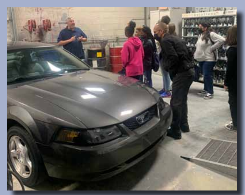
Above: Williston students and faculty in CFCC's auto paint shop.

Right: On stage at the Wilson Center, visiting students learn about what's required to stage major musical events in the college's performing arts hall.