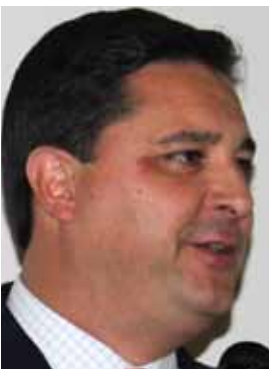
Rouzer: veterans' issues

In addition to our traditionally strong array of outside speakers, recent programs have also featured Rotarian experts on various topics.