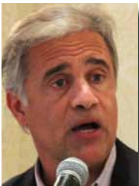
Saffo: City of Wilmington