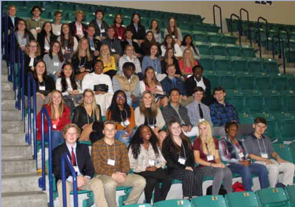
Wilmington RYLA participants pose for group portrait in Trask Coliseum after session ended.