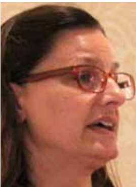
Wilsey: ILM Airport