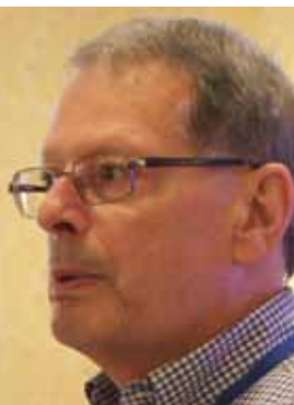
Sackett: Club database