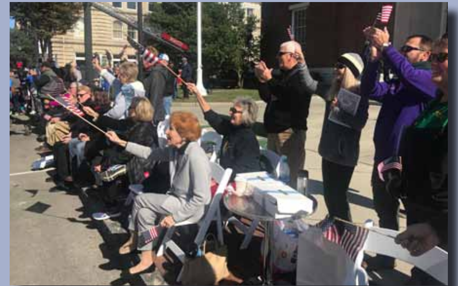
Rotarian cheering section on Front Street shows enthusiasm as our club's float passes.