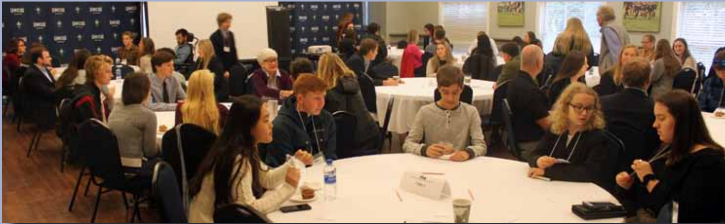
High school juniors prepare to begin round-table discussions about leadership, goals and careers, with Rotarians and other adult volunteers.