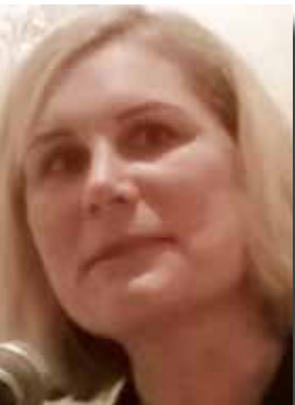
Estep: County schools