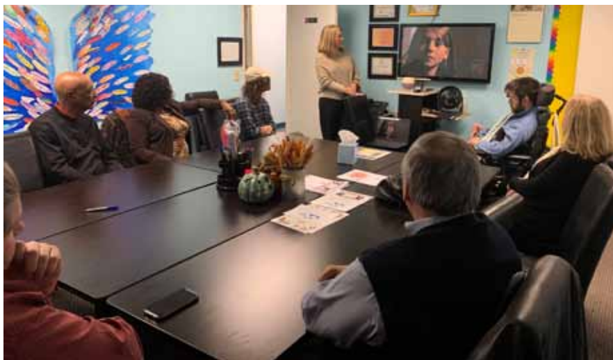
Rotarians watch presentation about Carousel Center's services for abused children.