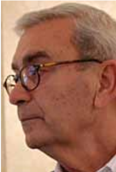
Vardakis: PHF + 2