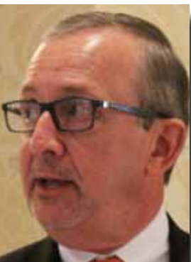
Peele: Farm Bureau