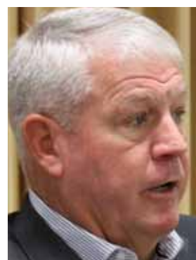
Gurganus: security threats