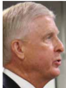
Tillman: Lowes' stores