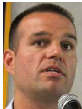
Mohr: Cutter 'Diligence'