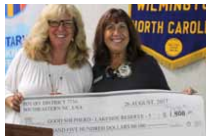
Combined district and local grants presented on Sept. 26, with big symbolic checks from District