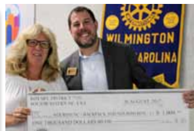
7730, included $1,500 for Good Shepherd’s Lakeside Reserve housing project; $1,000 for