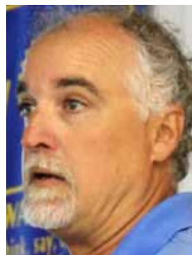
Styron: shellfish farming