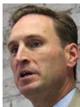
Gizdik: health economics