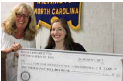
Cape Fear Literacy Council; and $1,000 for Nourish NC’s backpack program.