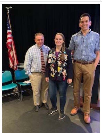
A successful Rotary Youth Exchange information session