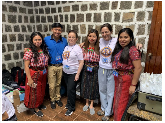
Team members geting ready...