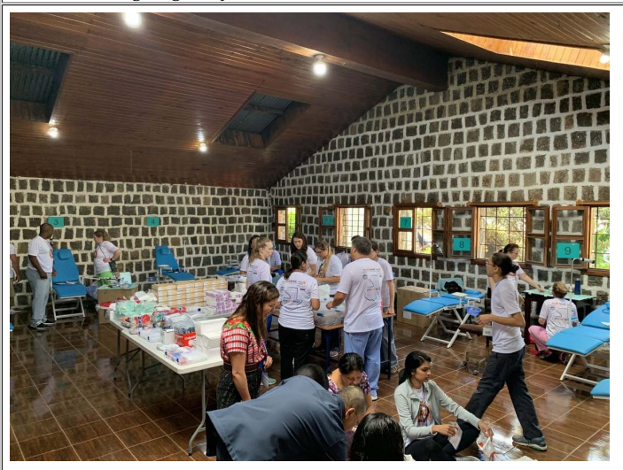
Dental Project day one...