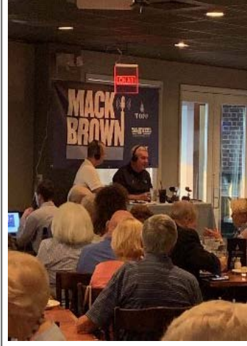
Getting ready for our Rolling Tailgate with a Mack Brown update