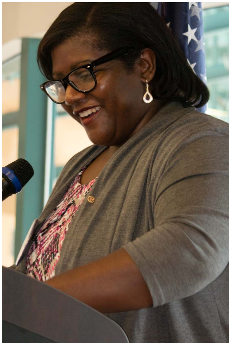
Scholarship Award Recipients --- Congratulations To All!