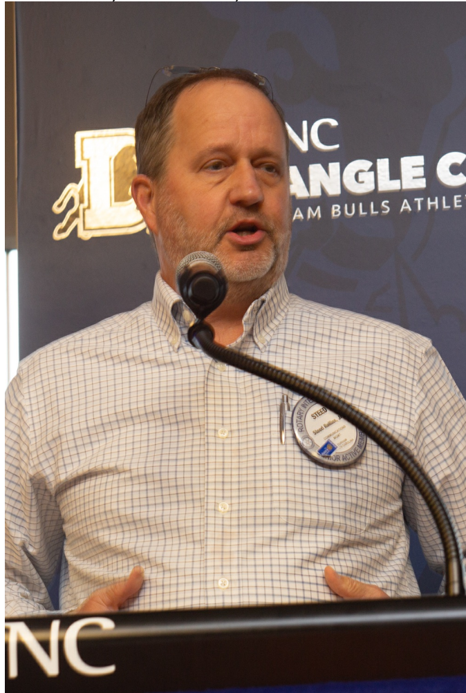
Durham County Commissioner Candidates