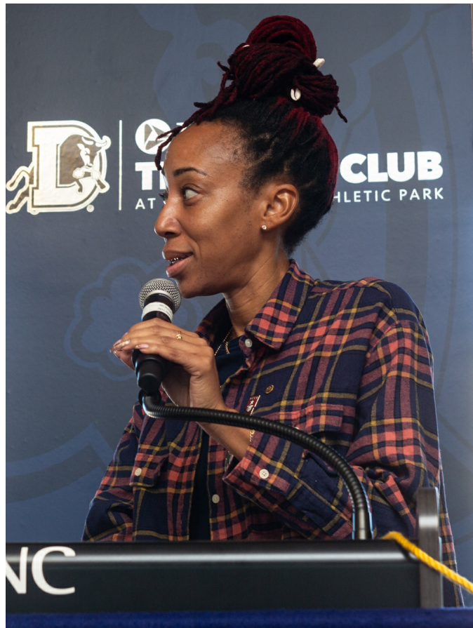
WELCOME NEW MEMBERS!!! The Rotary Club of Durham Welcomes 8 New Members!