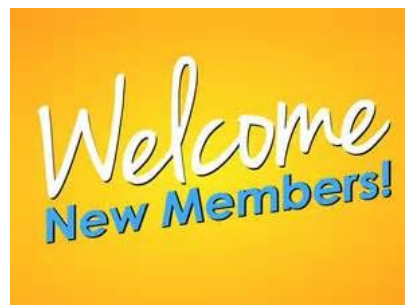
New Members & Their Sponsors