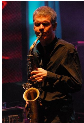
DAVID WILLIAM SANBORN