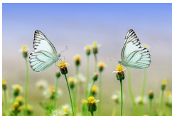
Dogwood Park Butterfly Pollinator Garden Maintenance

We need help providing ongoing maintenance to the pollinator garden at Dogwood Park in Wesley Chapel. Be sure to bring your spade, a pair of gloves, and your biggest brimmed sun hat. Then, after we're done planting, we'll enjoy a leisurely stroll around the park and lunch.