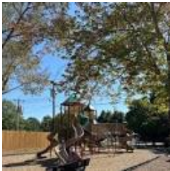
David G. Barnes Park Beautification TBD

Meeting Location: Dogwood Park, 121 Lester Davis Rd, Waxhaw, NC 28173 Project Dates: 5/12/24