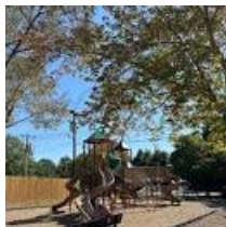
David G. Barnes Park Beautification

Meeting Location: Dogwood Park, 121 Lester Davis Rd, Waxhaw, NC 28173 Project Dates: 3/10/2024 & 5/12/24