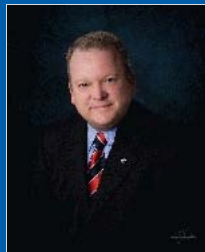
Fre Bla Clu Dir