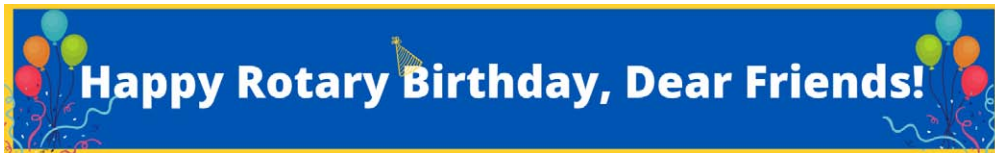
Luke Upchurch - Jun. 11