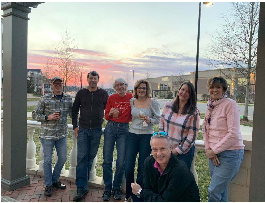
Ladies night out