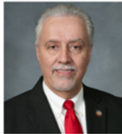
Sen. Carl Ford