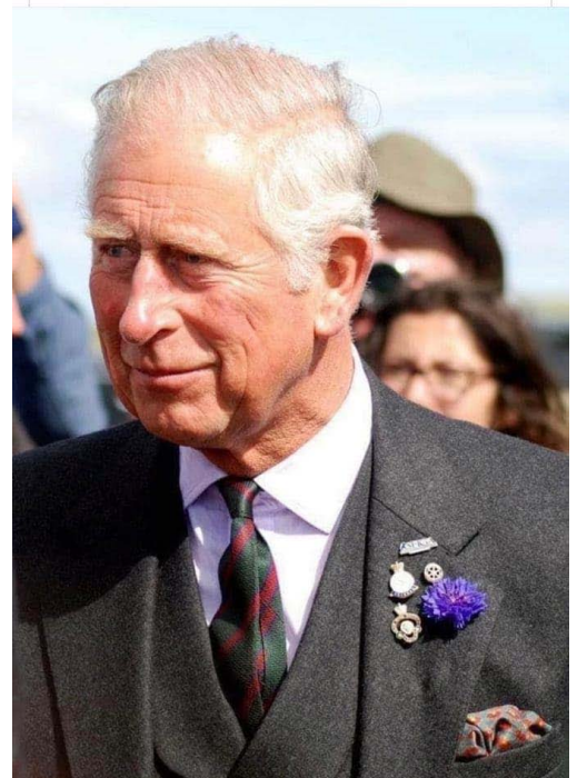
King Charles III wearing a Rotary pin!

On his webpage it says, “The Prince uses his position to help raise public awareness about sustainability challenges and solutions through his speeches, articles, books and