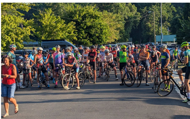
At 7:30 AM the National Anthem was played, and the riders were off on their tour.