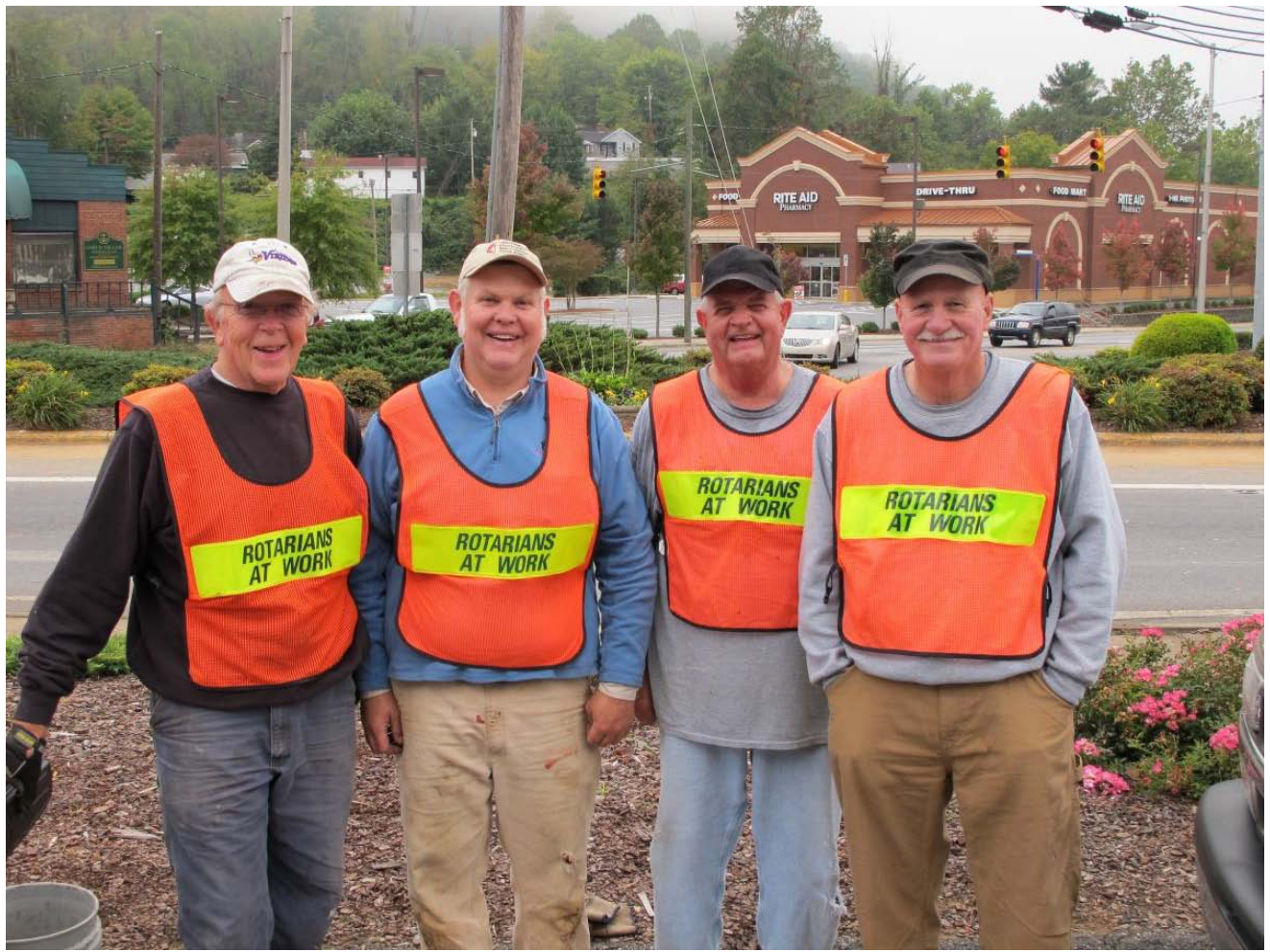
From the Tuckasegee River cleanup in 2013: