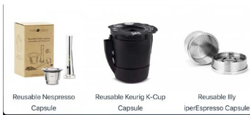
Reusable Nespresso Capsule

Here's the rub: we can't be true to the serious environmental issues we face if we don't include how we make our coffee.