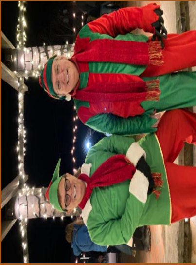
appearance at the holiday parade. Thank you M&M!