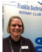
Vicki Lawrence January 23rd