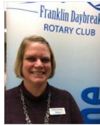
Vicki Lawrence October 7th