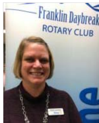
Vicki Lawrence October 7th