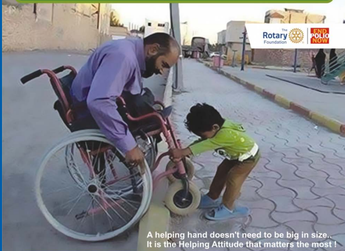
A helping hand doesn't need to be big in size... It is the Helping Attitude that matters the most!