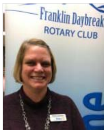
Vicki Lawrence January 23rd