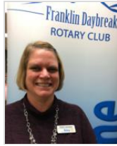
Vicki Lawrence October 7th