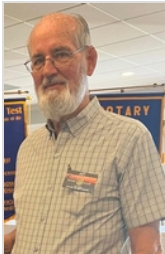
Art Wall 1 Year