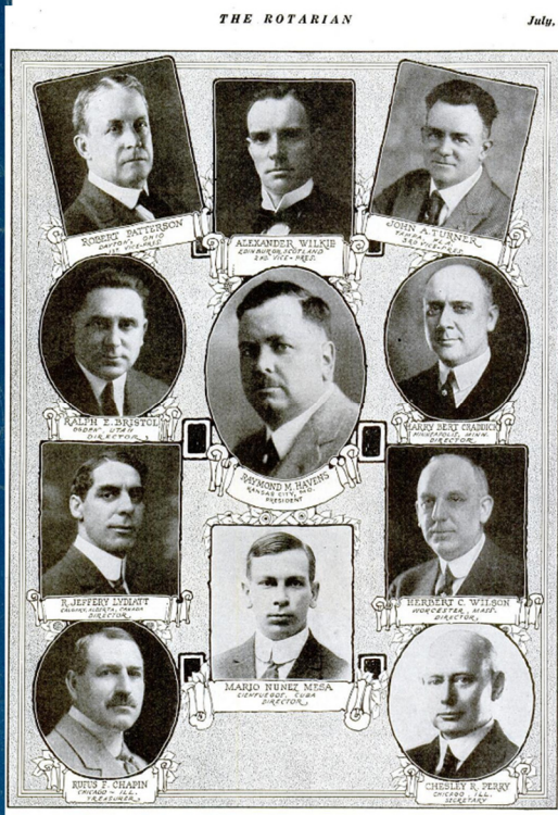
OFFICERS AND DIRECTORS OF ROTARY INTERNATIONAL 1922-1923