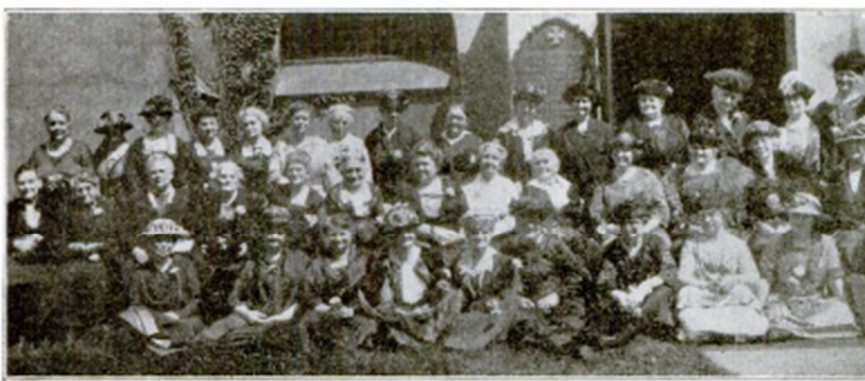
Many Rotary clubs paused from their work on Mother's Day to do honor to those who really gave Rotary to the world—the Mothers of Men! The Rotary club of Sayre, Pa., held a "Mother's Day" luncheon, each Rotarian acting as a host to his mother. During the course of the luncheon, prizes were given to the oldest mother present, to the mother who had the honor of rearing the largest number of children, and a beautiful bouquet of carnations was presented to another of the group who had given two sons to her country.