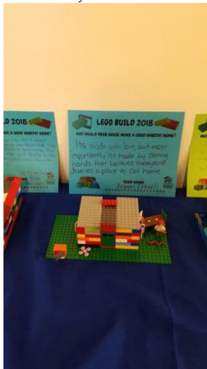
On November 17th, the River City Rotary volunteered at the 5th Annual Greater Richmond Habitat for Humanity Lego Blitz Build. To learn more about this child-centered event go > HERE .