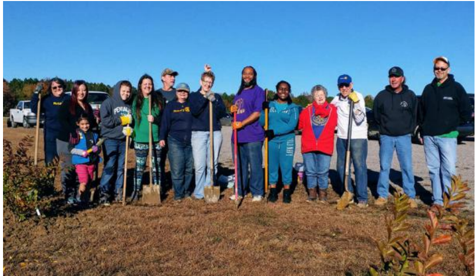
Recently members of the Prince George Girl Scout Troup 5149, the Prince George Parks and Recreation Department and the Rotary Club of Prince George planted 20 crepe myrtle trees by the soccer fields in Prince George County.