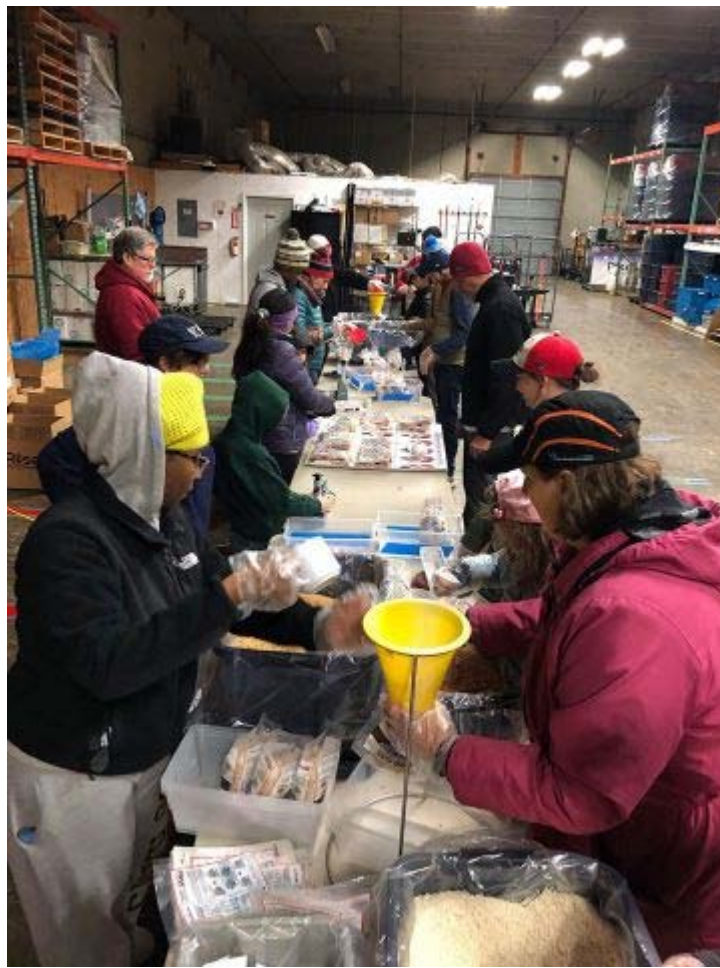
Thanks to all the generous people who donated and volunteered at the Club's Martin Luther King Day of Service Event at Rise Against Hunger. They packed over 3,000 meals to help feed and support the most vulnerable in this world.