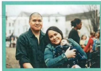
A family enjoying an Edmarc event

Thank you for supporting all the important work we do here at Edmarc. Because of your generosity, families never receive a bill for any of our services. Because of you, we can provide hope for the journey , one family at a time.