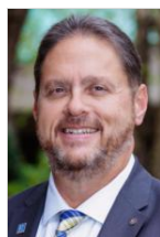
Michael M. Gleason Community Service Chair