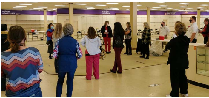
the Hopewell COVID Vaccination Clinic