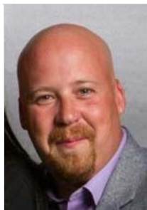
Doug Atkins 16 Years