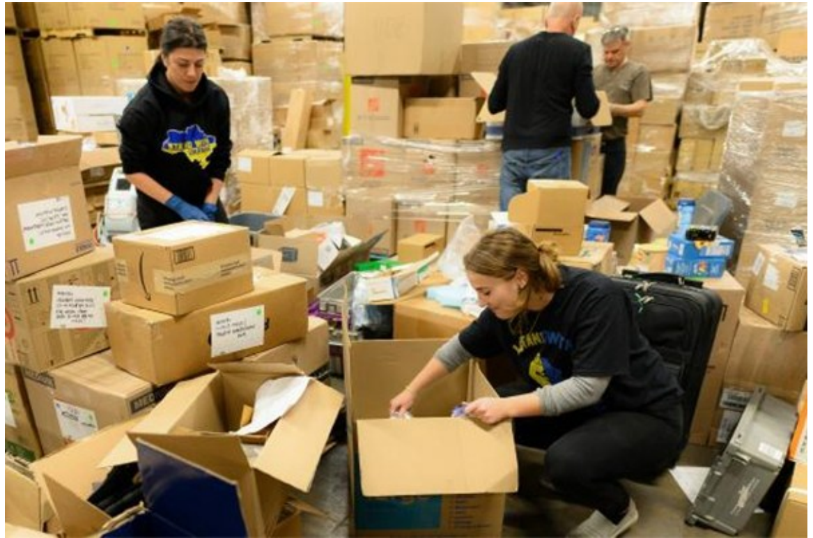
Volunteers sort and label boxes of medical donations at a warehouse around O'Hare airport in February 2022 for airlift to Ukraine.